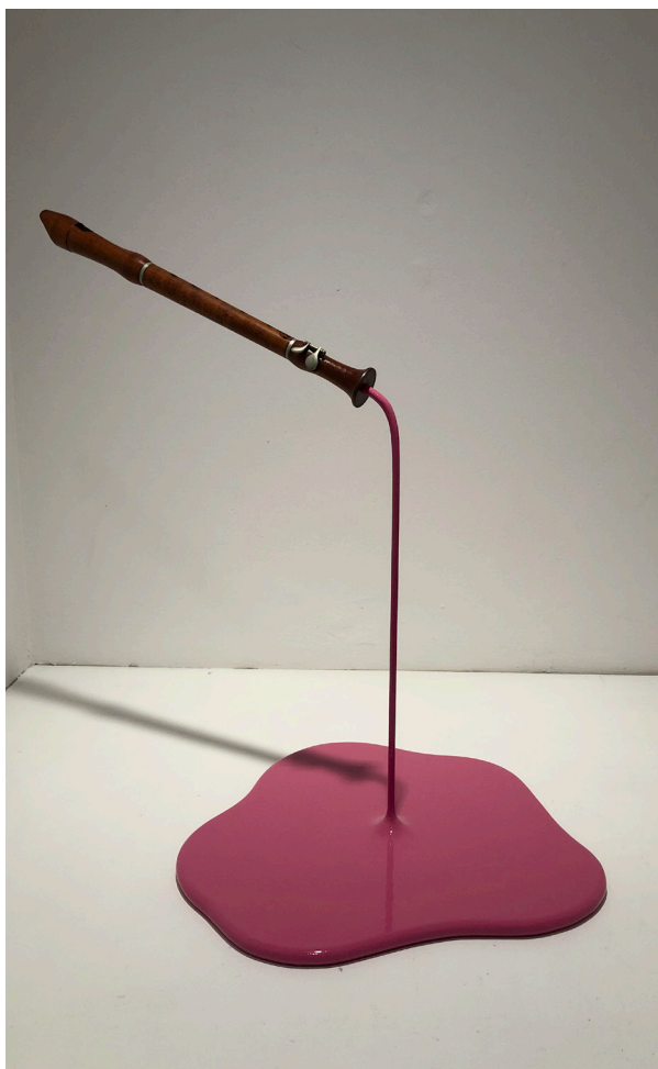
Die Zauberflöte 2019

sculpture | flute, metal, MDF, filler, lacquer | 72x74x50cm