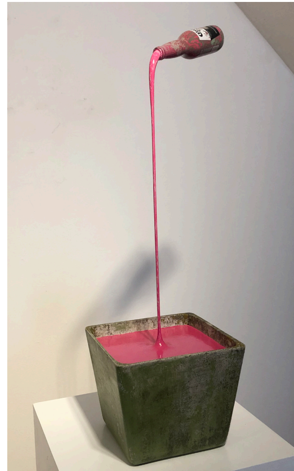
Corona 2020 sculpture | glass, metal, filler, Eternit | 90x40x33cm