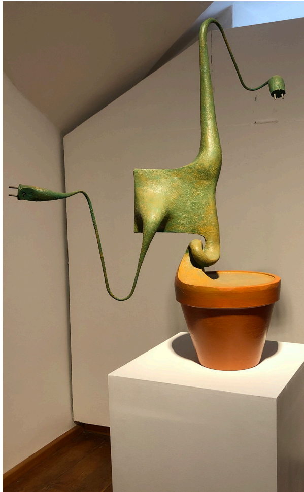
Elektrische Pflanze 2015

sculpture | pot, ceramic, filler, paper, lacquer | 94x65x48cm