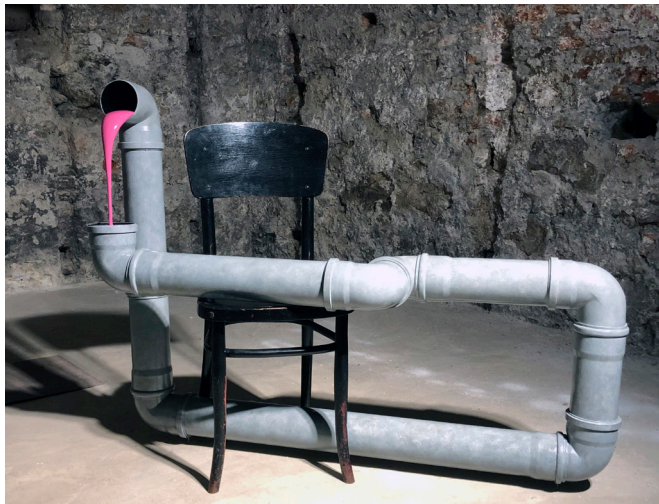
A Perfect Way to Waste Time (sitzend) 2020 sculpture | pipe, chair, filler, MDF, lacquer | 100x130x50cm