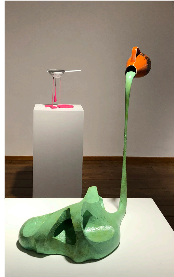
Flüssiger Gedanke 2020

sculpture | pot, ceramic, filler, paper, lacquer | 94x65x48cm