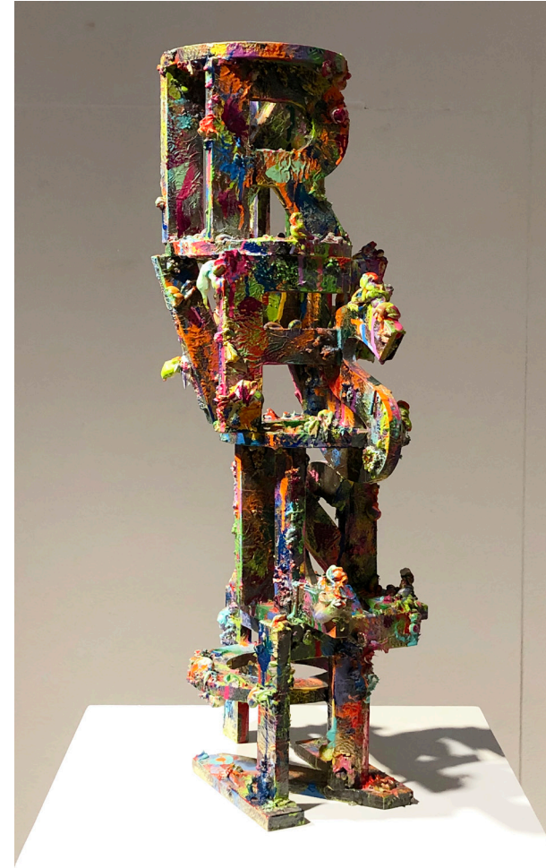
Form Follows Function 2020 sculpture | MDF, paint | 65x30x24cm