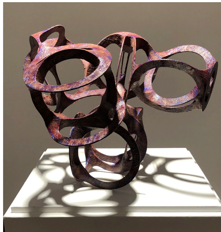
Der Gedanke 2020

sculpture | aluminium, filler, paper, lacquer | 50x50x60cm (variable)