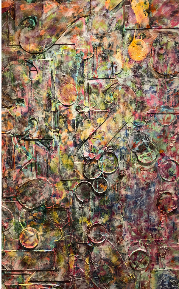
Alles was vom Jahr übrig blieb 2020 painting | metal, paint | 160x120cm