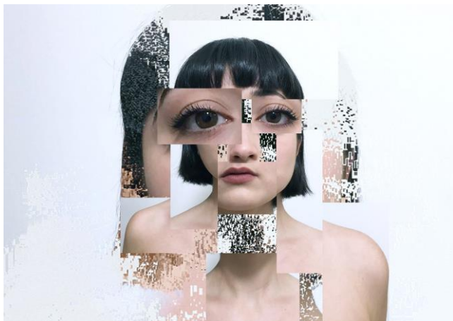
„Portrait of a Generative Memory“ © Indira de Benedetto

The unknown, the untamed, the resilient, the random, the loud and the roving will find their space into the inner city on 5 days (9.-13. September). The focus will be on works by young artists who have the reputation of being especially resilient. Giving up is not an option; even in times of the pandemic crisis. Like in an ecosystem they have adapted to these harsh conditions and looked for new ways to be creative; their results will be presented here.